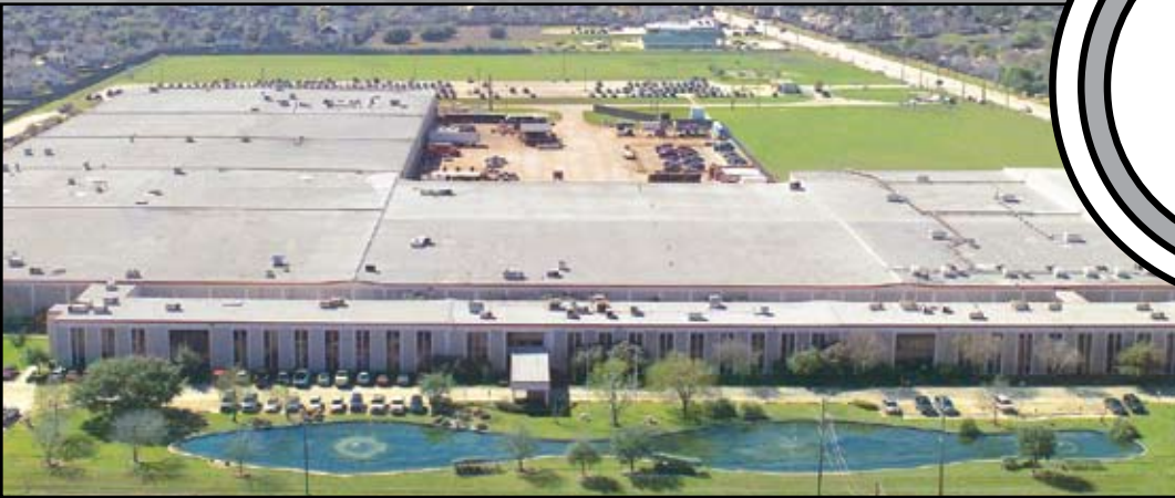
North American Headquarters and Manufacturing Facility (Houston, TX)