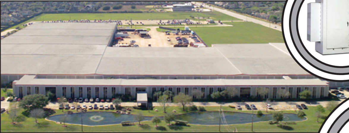
North American Headquarters and Manufacturing Facility (Houston, TX)