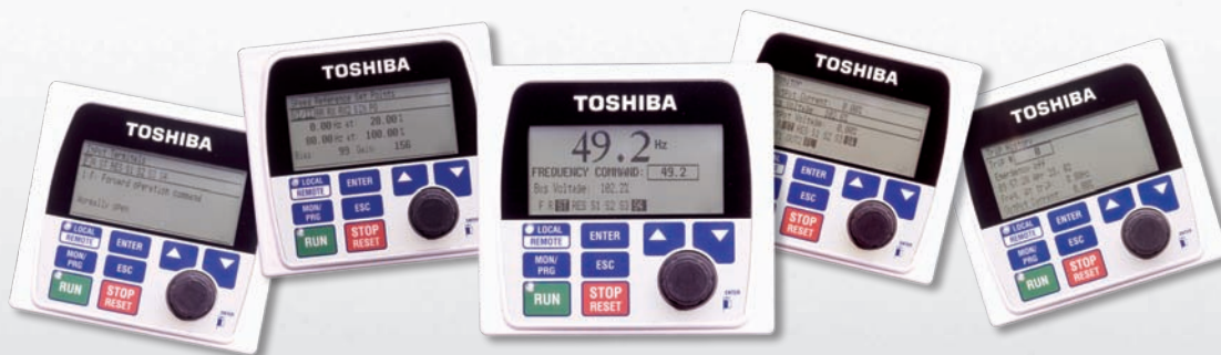
Standard Keypad Design for Low Voltage and Medium Voltage Drives